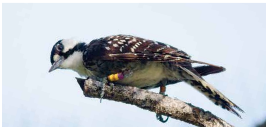
The red-cockaded woodpecker benefits from a strong Fish and Wildlife Service in Florida.

Not surprisingly, California and New York are the movement’s leaders. But in the following pages, you’ll see how even in conservative states, the conversation has changed. Environmental progress is finding a home in mainstream political discourse and being recognized as vital to economic growth and public health.