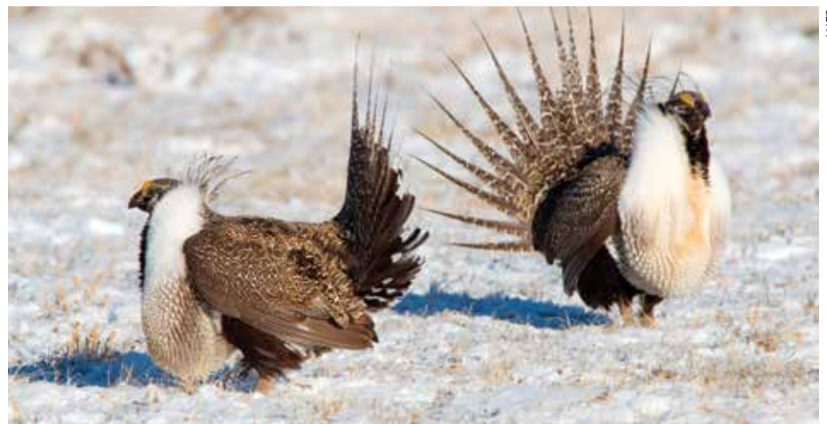
Wyoming is fending off federal threats to the protection of the greater sage grouse.

and gas wells in western Wyoming and on cutting ozone. You're now expanding that work statewide. Given the lack of encouragement for pollution controls at the federal level, why go through with this?